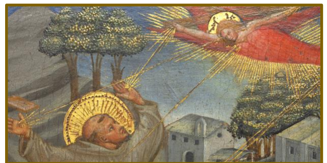
Stigmata by Bicci di Lorenzo

O Lord, you sent the Seraph to mark St Francis With Jesus' wounds, a visible sign of your love for us In the mystery of the cross. May your Church today, through our lives and actions Be a visible sign of healing and renewal For all the world. We ask this in the name of Jesus, Who showed to us the meaning of mercy. Amen