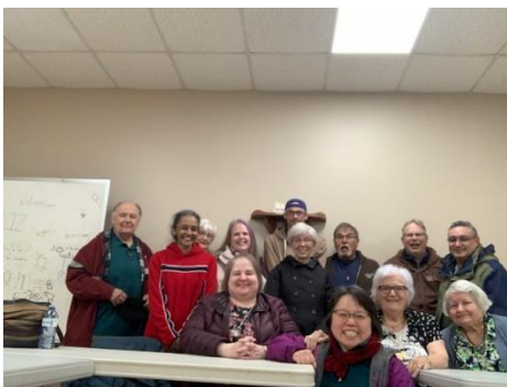
Visit with St Berard Fraternity in Sherwood Park, AB