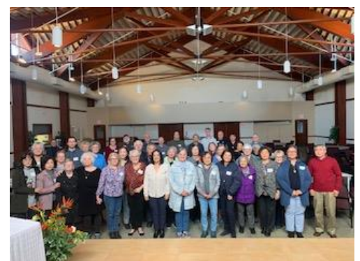
BC Coastal Chapter of Mats in Coquitlam, BC