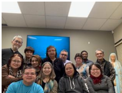
Visit with Sts Louis & Zelig Fraternity in Edmonton, AB