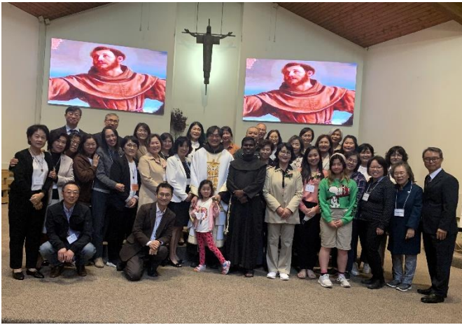
St Francis of Assisi Korean Fraternity of Surrey, BC at St Joseph the Worker Church on Sept 23, 2023