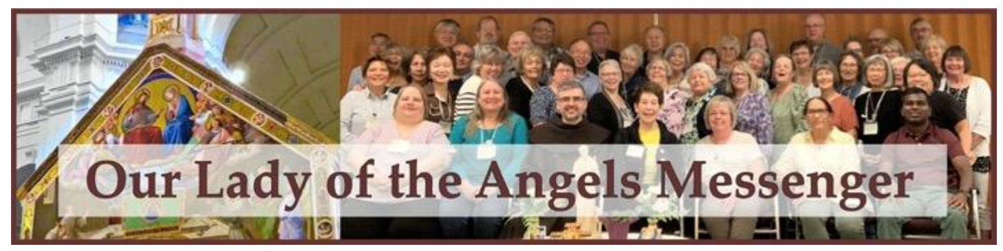
Issue no. 39 – November 2023