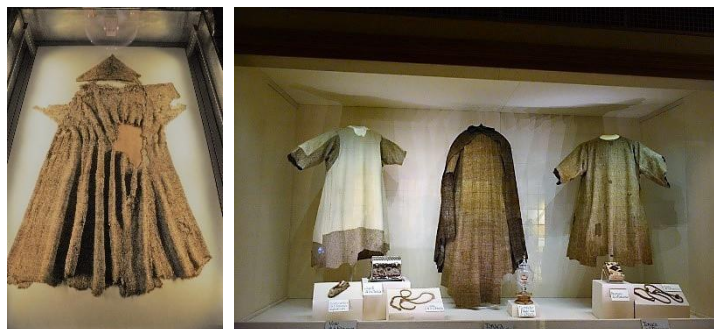
Original Clothes of St Francis & St Clare