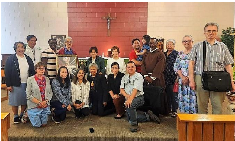
St. Anthony of Padua Fraternity in Winnipeg, Manitoba Renewal of Profession June 18, 2023.