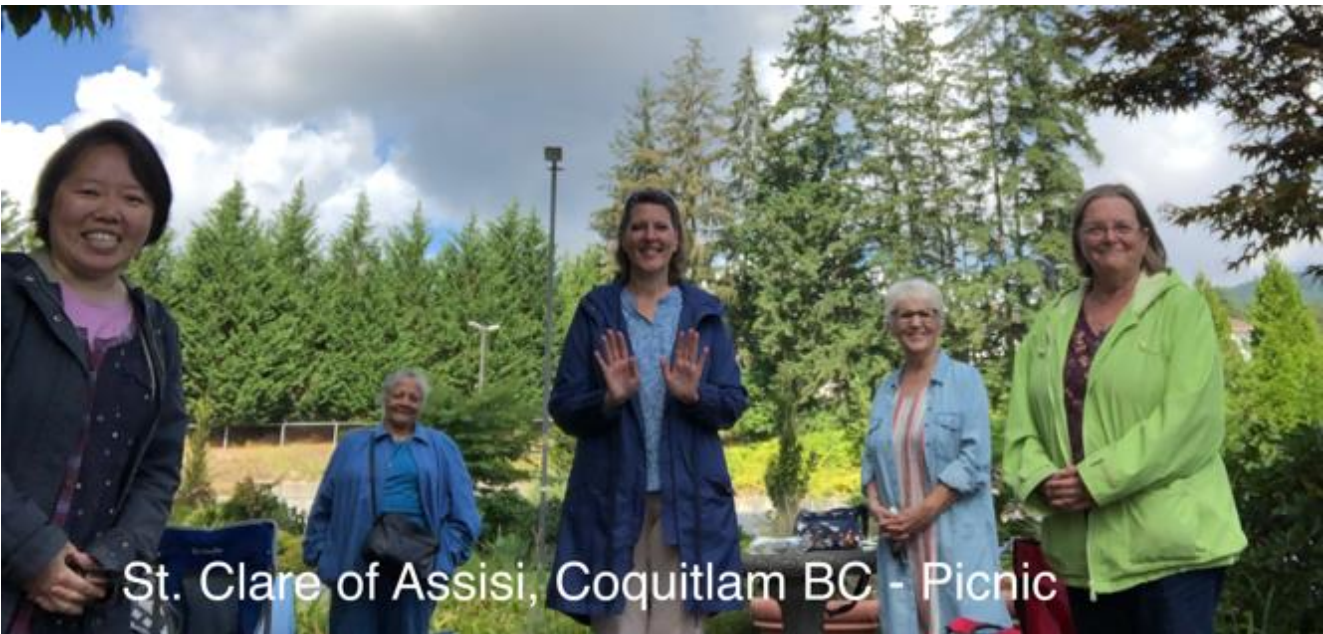
St. Clare of Assisi, Coquitlam BC - Picnic