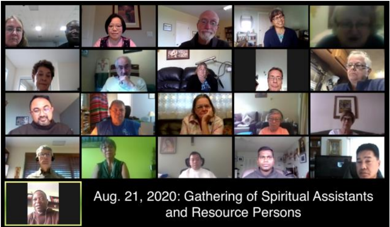
Aug. 21, 2020: Gathering of Spiritual Assistants and Resource Persons