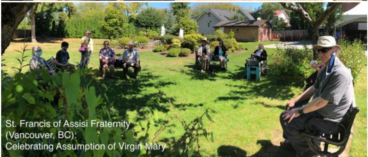
St. Francis of Assisi Fraternity (Vancouver, BC): Celebrating Assumption of Virgin Mary