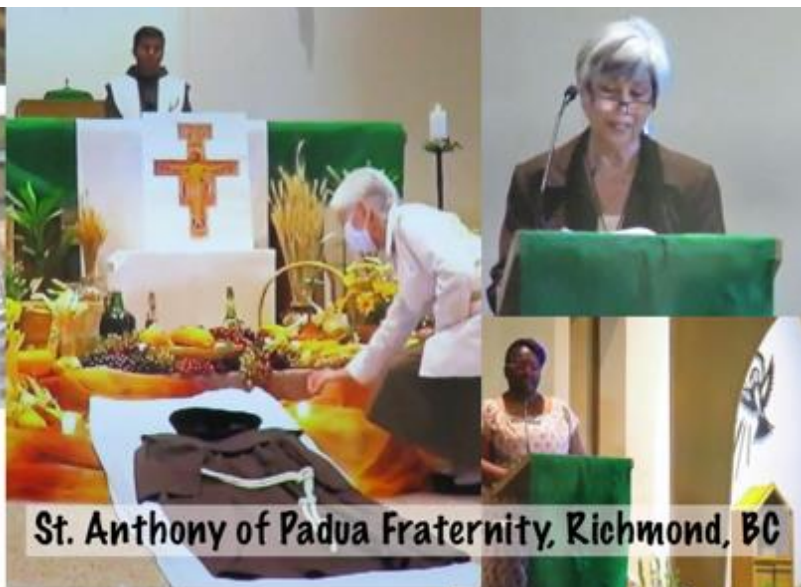
Oct. 3, 2020: Transitus of St. Francis of Assisi