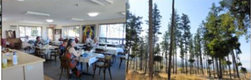
Little Flowers of St. Francis Fraternity, Kelowna, BC