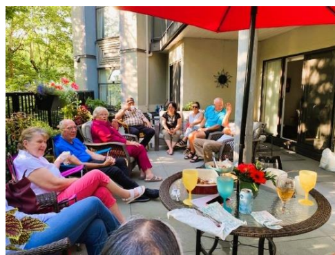
St Clare of Assisi Fraternity of Coquitlam, BC celebrate their summer potluck on August 14 th .