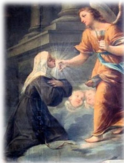
Saint Angela of Foligno 1248-1309

Born of a leading family in Foligno, Italy, she became immersed in the quest for wealth and social position. As a wife and mother, she continued this life of distraction. Around the age of 40, she recognized the emptiness of her life and sought God's help in the Sacrament of Penance. Her Franciscan confessor helped Angelina to seek God's pardon for her previous life and to dedicate herself to prayer and the works of charity. Shortly after her conversion, her mother, husband and children died. Selling most of her possessions, she entered the Secular Franciscan Order (Tertiary) . She was alternately absorbed by meditating on the crucified Christ and by serving the poor of Foligno as a nurse and beggar for their needs. Other women joined her in a religious community. At her confessor's advice, Angela wrote her Book of Visions and Instructions . In it she recalls some of the temptations she suffered after her conversion; she also expresses her thanks to God for the Incarnation of Jesus. This book and her life earned for Angela the title " Teacher of Theologians ." She was beatified in 1693, and canonized in 2013. (Franciscan Media)