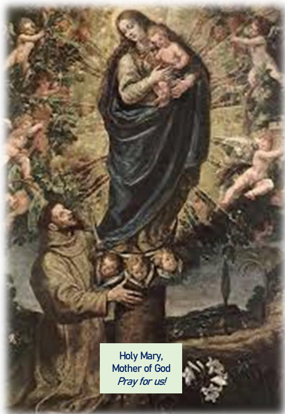
Holy Mary, Mother of God Pray for us!