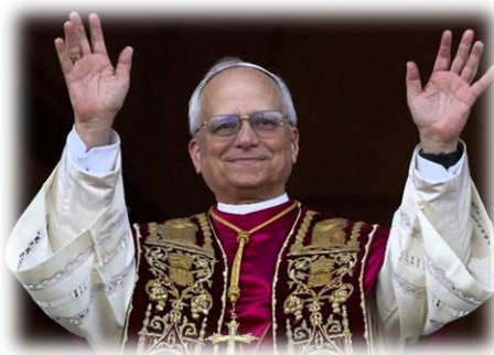
Pope Leo XIV Vicar of Christ

general constitution article 23.2 so that it follows rule 19. Bible stories and history have shown that prayers and faith are more effective and powerful than human weapons. Here are some updates: