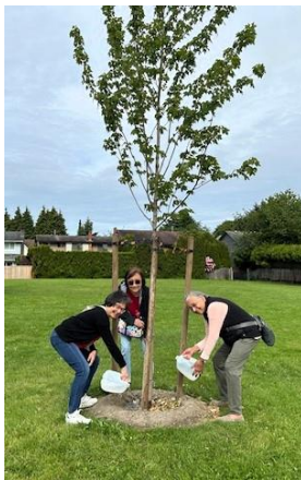
St Anthony of Padua Fraternity of Richmond, BC sponsored the planting of a new tree on their parish grounds marking the 8 th Centenary of the Cantic of Creatures.