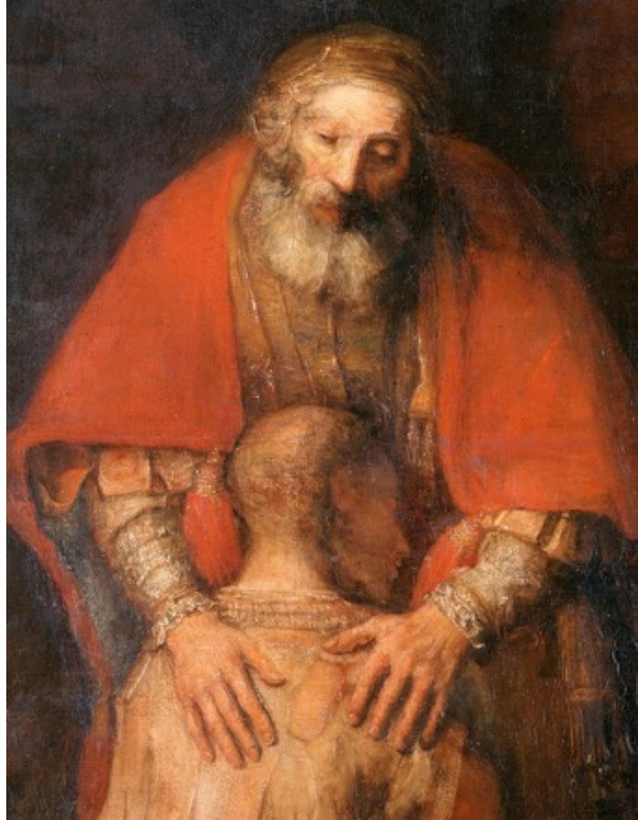
Rembrandt (1606-1669), Return of the Prodigal Son