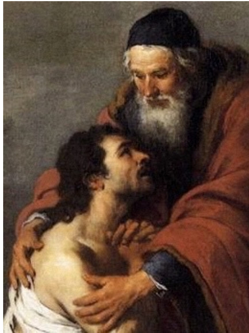
Murillo (1618-1682), Return of the Prodigal Son